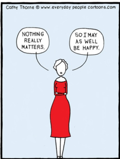
THE OPTIMISTIC PESSIMIST.